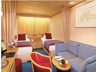
Inside Staterooms $799 ppbdo*