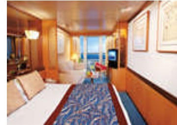
Veranda Staterooms $1779 ppbdo