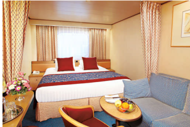
Ocean View Staterooms from $899-1019 ppbdo*